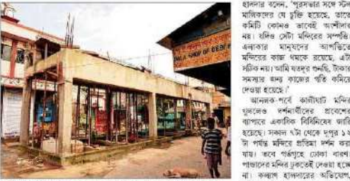
কালীঘাট মন্দির সংস্কারের কাজ চলছে।

কালীঘাট মন্দির সংস্কারের কাজ চলছে। মন্দির সংস্কারের কাজ চলছে। মন্দির সংস্কারের কাজ চলছে।