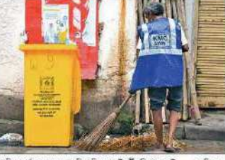
কোভিড-১৯ের কারণে মজুরি নেই।

লকডাউন বৈধ না হওয়ায়, যত্ন নেওয়া হয়নি। লকডাউন বৈধ না হওয়ায়, যত্ন নেওয়া হয়নি।